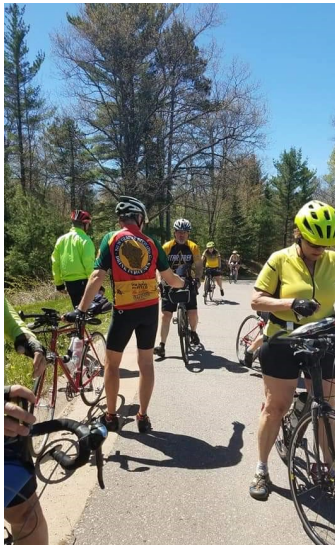
Organizing or Disorganizing?