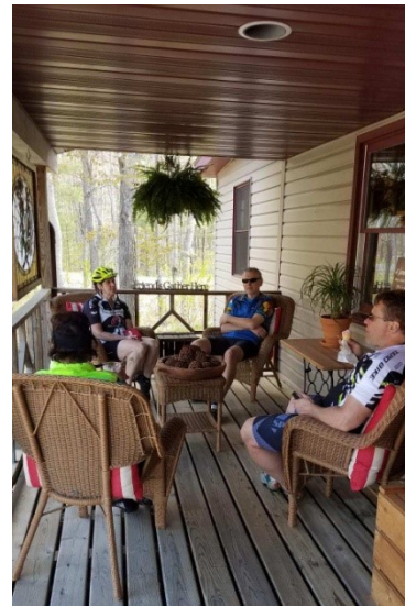
Relaxing on the Porch