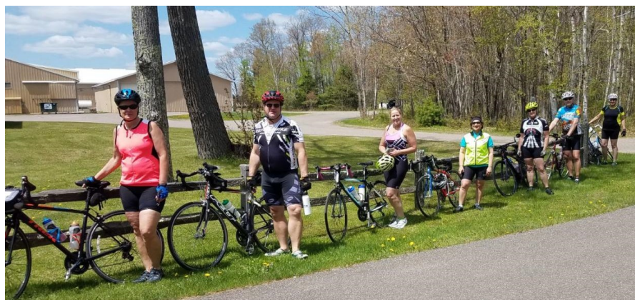
At the Cranberry Farm for Gifts and Cranberry Ice Cream