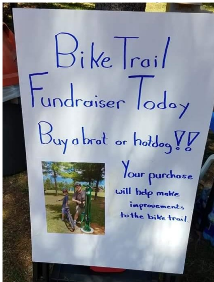
Fundraiser at The Corner Store to buy a bike fix-it station for the trail.