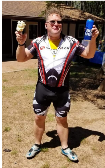
Ice Cream & Beer