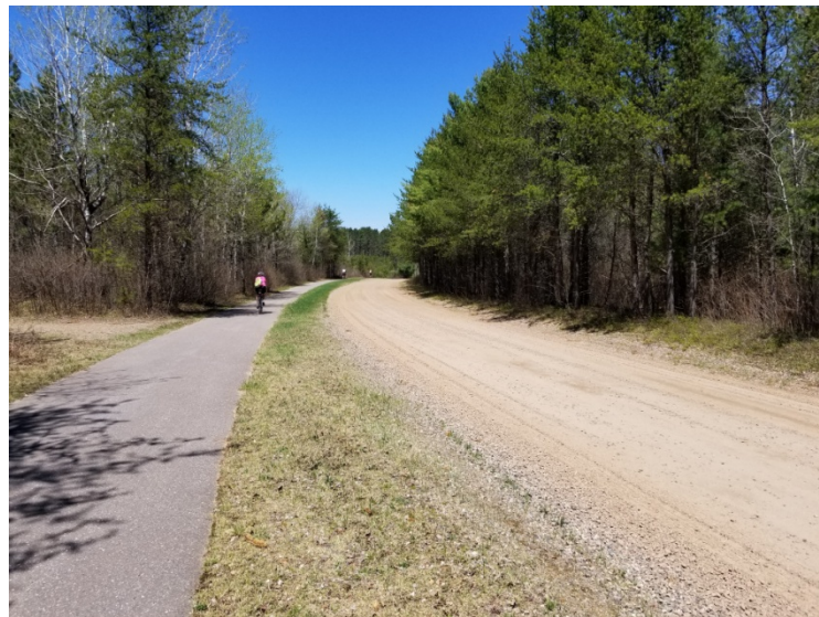
UpNorth: a place where the bicycle trail is paved and the road is not!